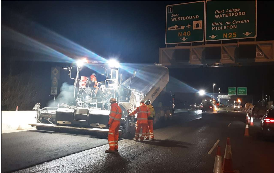
Surfacing works on the N25 Eastbound being progressed to completion