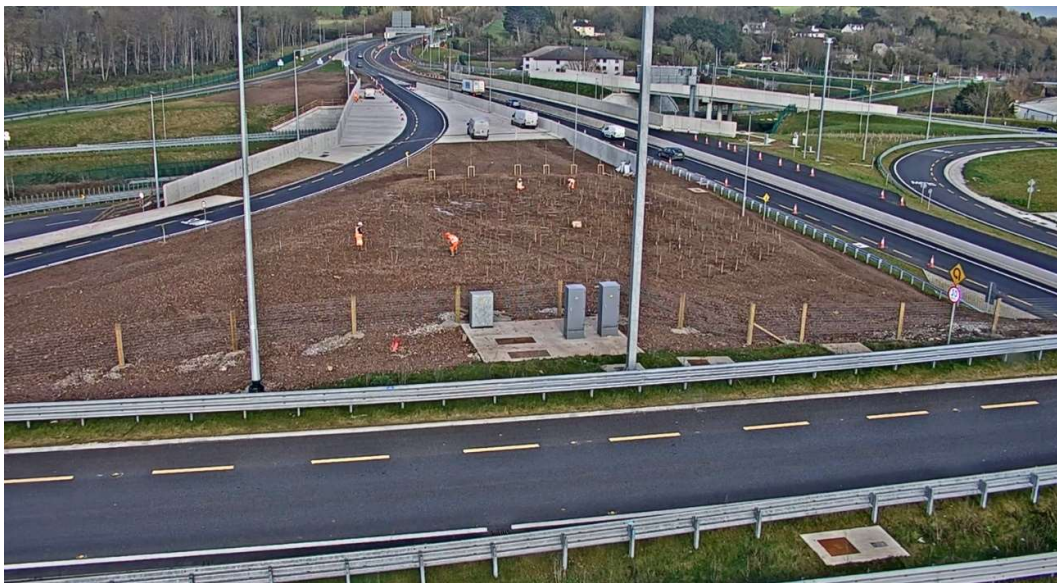
Ongoing Landscaping Works at the Northern Section of the Interchange