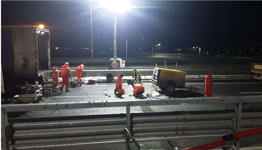
Expansion Joint Installation Works at Structure ST14